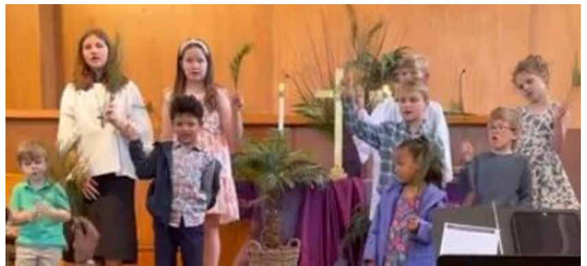
Children Sing "Hosana, Hosana" on Palm Sunday