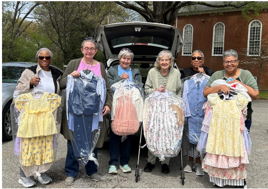
Church Women United Clothing Drive!