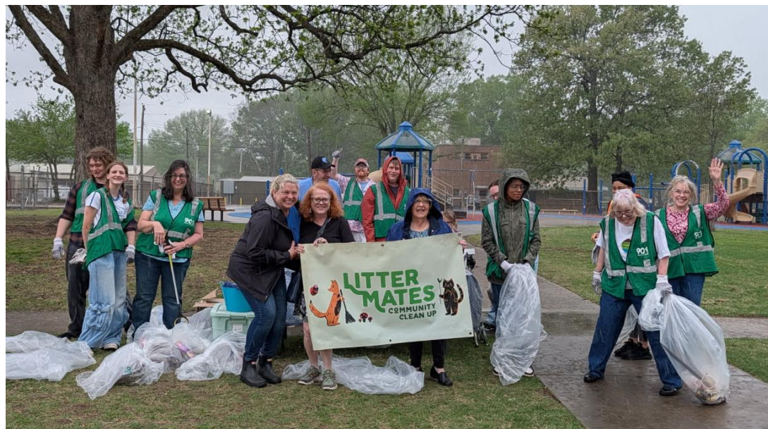
Litter Mates get the job done!