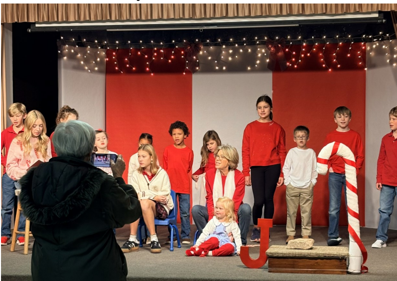
"Candy Cane" Rehearsal

"For I know the plans I have for you," declares the Lord, "plans to prosper you and not to harm you, plans to give you hope and a future." —Jeremiah 29:11