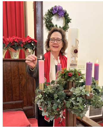
Chapel Advent wreath