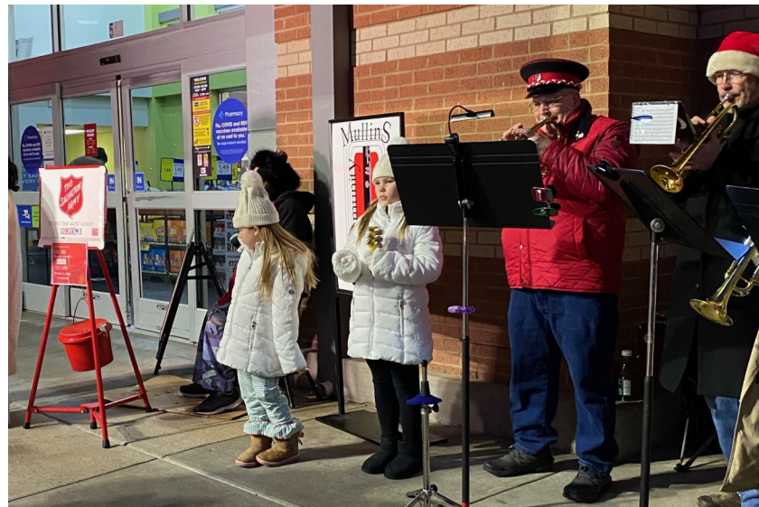
Salvation Army Support