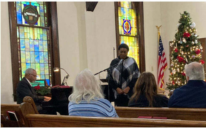
Remembrance Service Music