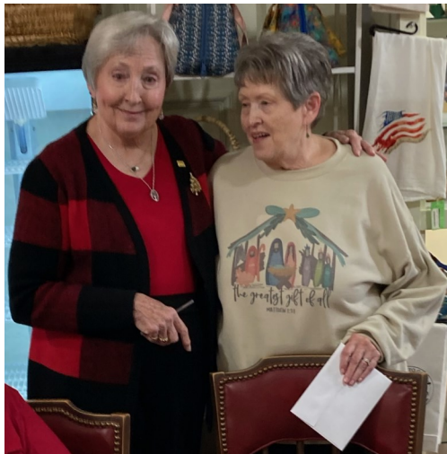
UWF Fond Farewell