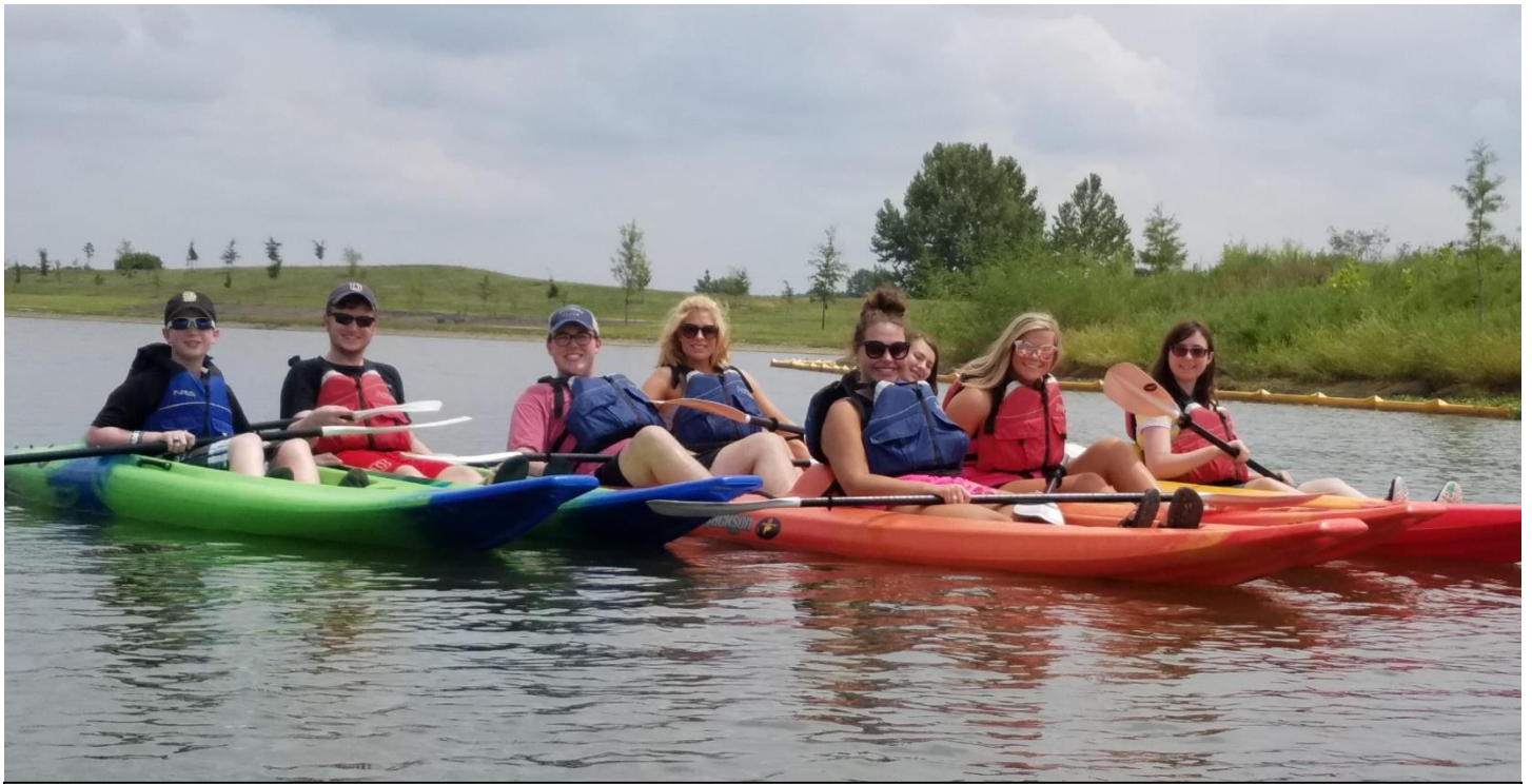
Taking a break from the planning during recent Mullins Youth Retreat